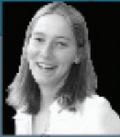
Rachel Corrie Palestine