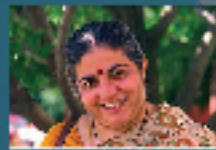
Arundhati Roy India