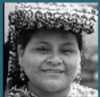
Rigoberta Menchu Guatemala