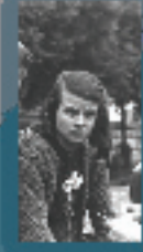
Sophie Scholl Germany