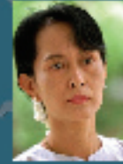
Aung San Suu Kyi Burma