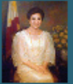
Corazón Cojuangco Aquino The Philippines