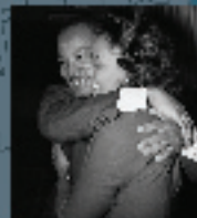
Coretta Scott King

To call woman the weaker sex is a libel, it is meant brute strength, then, indeed, is woman moral power, then woman is immeasurably ma is she not more self-sacrificing, has she not