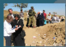
Machsom Watch Israel