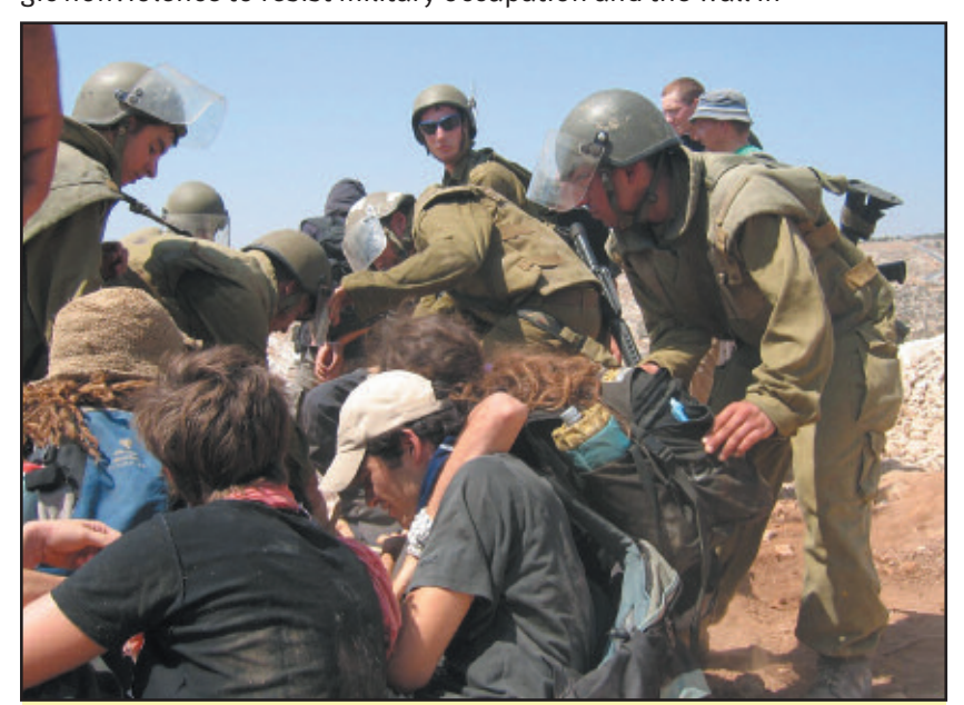
During the ongoing struggle in Bil'in, activists endure Israeli military violence and sit down together to block plans to confiscate the village's lands.

Despite the more prominent violent components of the second Intifada, many Palestinians have practiced strategic nonviolence to resist military occupation and the wall in