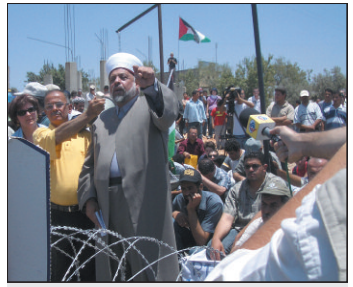
Palestinians at Bil'in march every Friday to protest the injustice of confiscation of their farm lands.

As powerful as media coverage can be in influencing international opinion in favor of the Bil'in struggle, perhaps we should not overlook the individual moments of "conversion" that occur when a resistor's courage reaches an oppressor's heart. We have heard reports of at least two off-duty Israeli soldiers or military employees who have come over to the village to join the people's struggle, and we suspect that as the Bil'in demonstrators grow in their dedication to nonviolence, their creative experiments will yield more goodwill and sympathy from the soldiers they face.