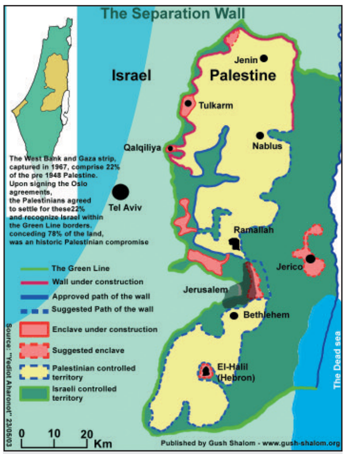
The wall unilaterally confiscates Palestinian land and reduces the West Bank to a series of disconnected mini-population centers. Israel's military uses dozens of barriers to control movement.

uring the summer of 2005, the mainstream media congratulated Israeli Prime Minister Ariel Sharon on the removal of settlers from the occupied Gaza Strip. Meanwhile, the state of Israel continued its policy of unilateral, illegal land confiscation in the occupied West Bank, both to expand settlements and make room to build a wall (described as "Apartheid Wall" or "Annexation Wall" by Palestinians, "Security Fence" or "Separation Barrier" by Israelis, here referred to simply as "the wall"). In fact, Dov Weisglass, a primary architect of the Gaza plan, stated, "It supplies the amount of formaldehyde that is necessary so there will not be a political process with the Palestinians...Effectively, this whole package called the Palestinian state, with all that it entails, has been removed indefinitely from our agenda."